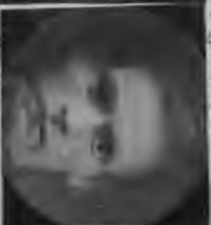
Fig. 27. ♂ —young