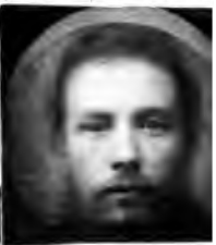
Fig. 16 Composite of 500