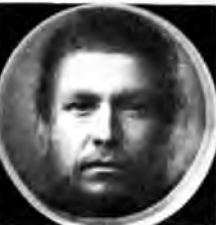
Fig. 14 Composite of 300