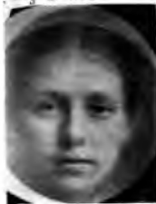
Fig. 7 Composite of 50