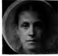
Fig. 2 Composite of 100