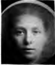
Fig. 4 Composite of 50