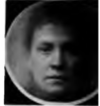
Fig. 3 Composite of 150