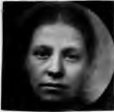
Fig. 1 Composite of 50