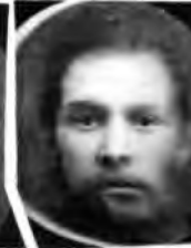
Fig. 20 Composite of 900