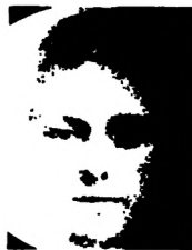
Fig. 8 Composite of 100