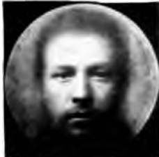
Fig. 11 Composite of 50