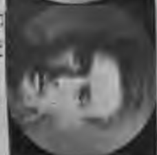
Fig. 24. ♂ —young