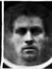
Fig. 18 Composite of 700