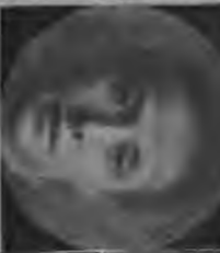
Fig. 30 (over)