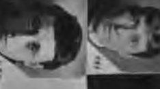
Fig. 33. ♂ —young