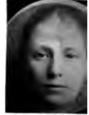
Fig. 6 Composite of 150