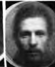
Fig. 19 Composite of 800