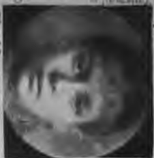
Fig. 31 (over)