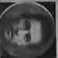
Fig. 22. ♂ —young