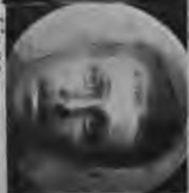
Fig. 28. ♂ —young