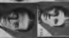
Fig. 31. ♂ —young