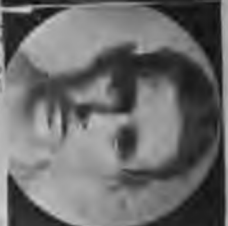
Fig. 23. ♂ —young