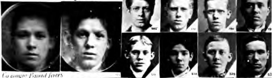
Composite facial faces