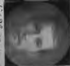
Fig. 25. ♂ —young