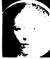
Fig. 5 Composite of 100