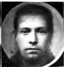
Fig. 15 Composite of 400