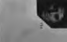
Fig. 34. ♂ —young