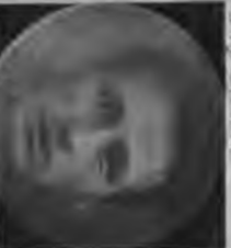
Fig. 26. ♂ —young