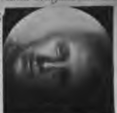
Fig. 29. ♂ —young