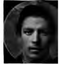
Fig. 12 Composite of 150