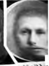
Fig. 21 Composite of 1000