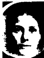
Fig. 9 Composite of 150