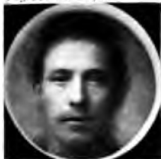
Fig. 13 Composite of 200