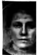
Fig. 10 Composite of 200