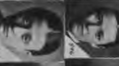
Fig. 32. ♂ —young