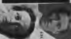
Fig. 30. ♂ —young