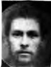
Fig. 17 Composite of 600